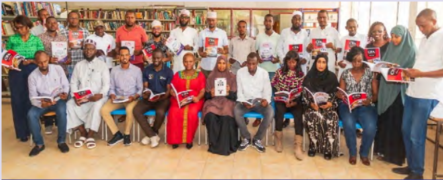
Figure 3 Nyeri, Mombasa, Embu, Kibra, Garissa Libraries