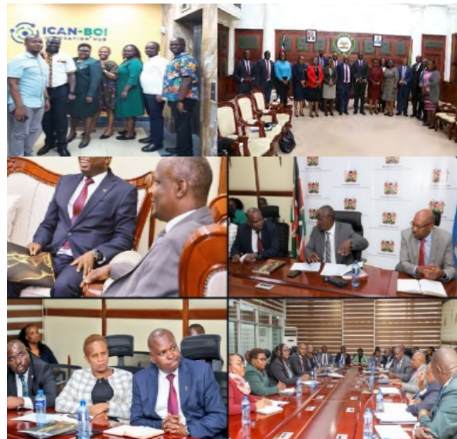
Figure 2 Sustainability Disclosure Road Map

These MoUs provide important avenues for appointment of CPAs to finance and accounting positions at the county level while positioning ICPAK as a technical player on matters finance, budgeting and accountability