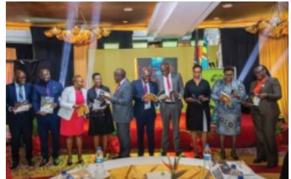
Figure 1 Strategic Plan launch